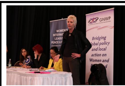
Madeleine Rees Civil Society Consultation on the 2015 WPS High Level Review, March 11, 2015

"Women are not just victims but as survivors. they are the key actors for providing the mechanisms for change" Charlotte Bunch Women Confronting ISIS, March 6, 2015